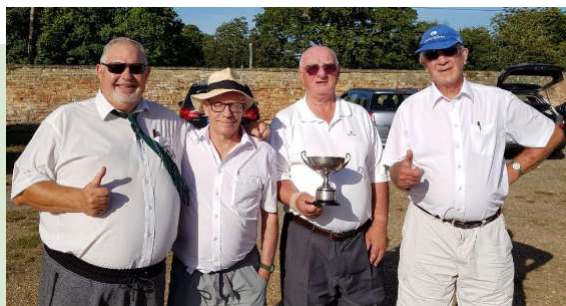
The finalists and winners from Kynaston Lodge No. 5810.