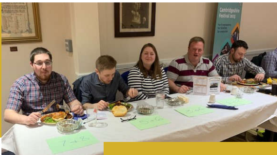
Some of the 70 'punters' enjoy the race interval meal.