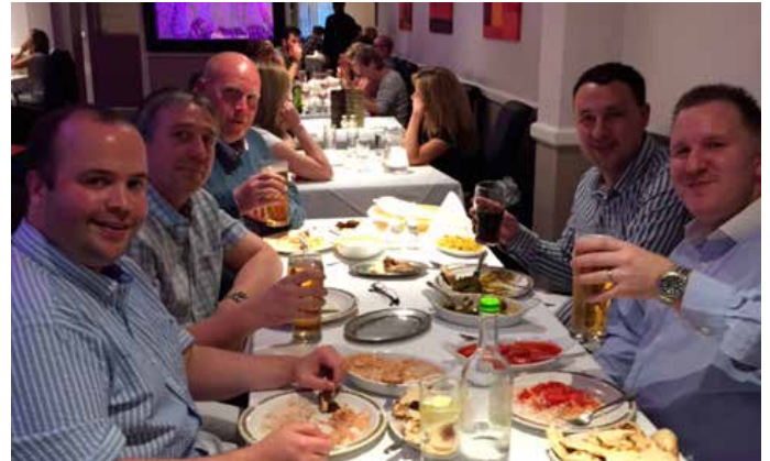
The new Cambridgeshire Light Blues' committee enjoy a curry

Events will be organised throughout the Province and will be varied from white table events, through impromptu evenings at a bar, to maybe a fishing trip or bowling competition.